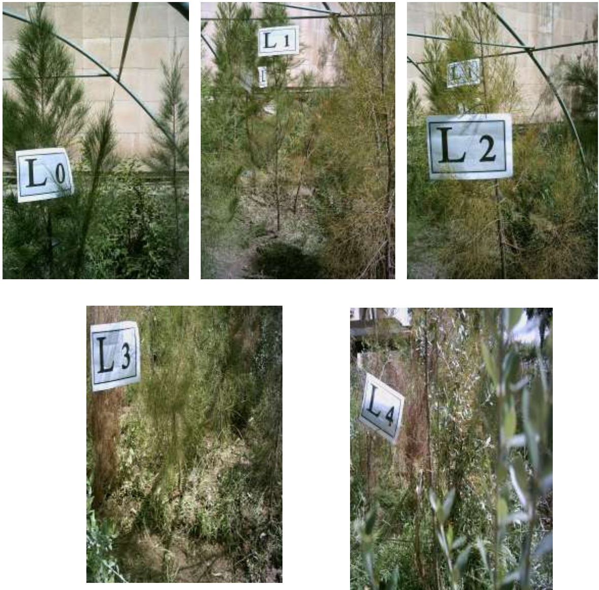
Fig 1: Effects of different levels of crude oil on growth of Casuarina equisetifolia seedlings as observed after six months.