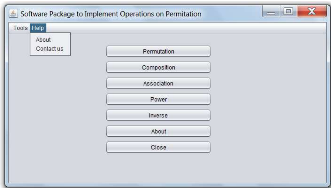
Figure (3): The main window (Help menu)